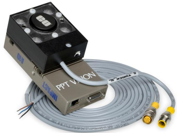
Light includes 4-meter cable - cable also available in 8, 15 and 30-meter lengths)

The RLD3 has 3 optic options for matching the area of illumination with the working distance